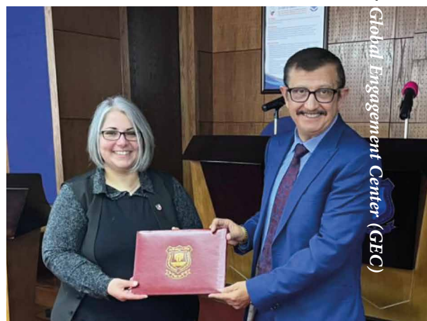
Published by: Global Engagement Center (GEC)